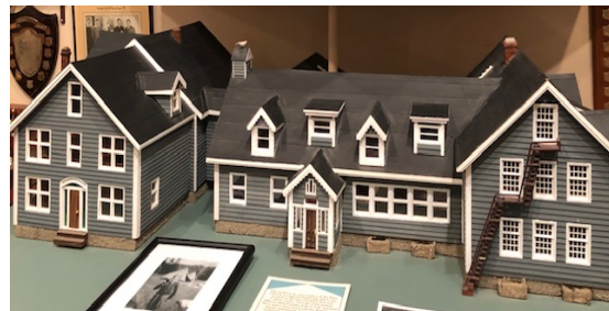
The T.R. Job Memorial for Girls