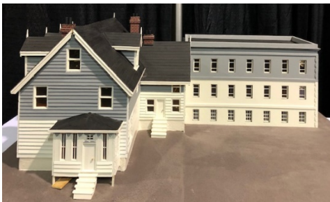
The Shannon Munn Memorial for Boys